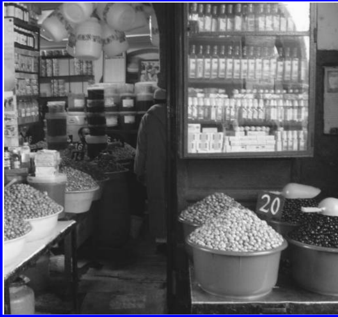
A market stall in the Marrakech souk (or marketplace). Ali Abedi, a member of the American team, took this shot to represent the concept of tradition, as the souk is one of the oldest in Morocco.

our meeting in Washington, D.C. in March 2012, when representatives from the U.S. and Moroccan delegations tried to resolve the question of the logo for our website. Both teams brought design suggestions to the table, and it quickly became obvious that there was a wide gap between the two sides in terms of design aesthetics—shapes and colors had vastly different meanings for each team. We debated, for example, about whether or not to include representations of our national symbols (such as flags and colors) and of our faiths (such as the crescent and moon) and how best to express visually our values of collaboration and partnership. We finally reached a decision and moved on to other topics, but the temporary logo design impasse reminded everyone of the importance of compromise in collaborative work.