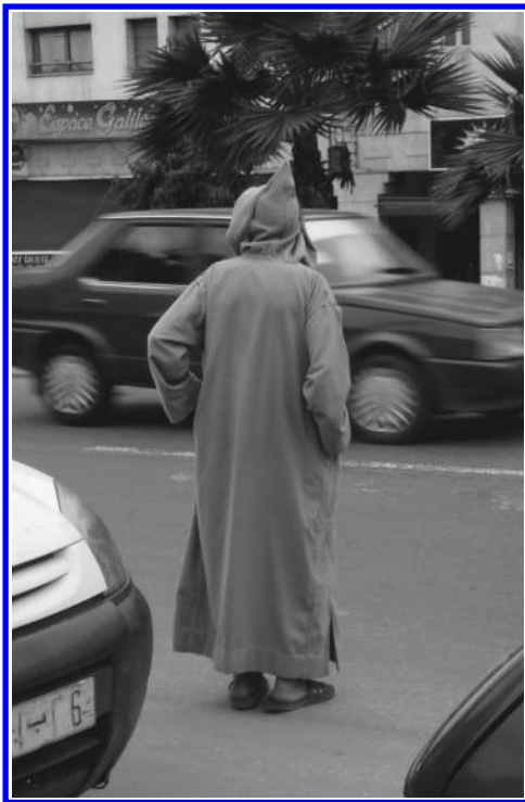
This photograph was taken in Hay Moulay Rachid, a district in Casablanca, near Ben M'sik Faculty (Hassan II University). It features a man who is wearing a "djelleba," or a traditional Moroccan robe.

in December 2011 to Morocco and the second in March 2012 in which American and Moroccan teams met in Washington, D.C. These trips were undoubtedly the highlight of our work together; the face-to-face interaction cemented bonds between the groups and gave the work a new meaning. The experience of a weeklong cultural immersion is not only paramount to the goals of the grant, but also provided a lasting educational component of our work.