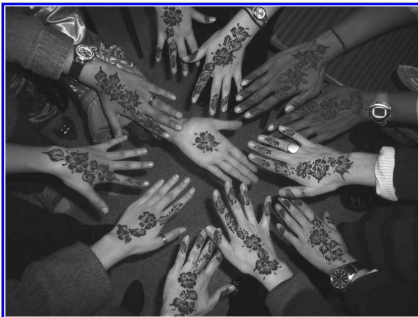
Hands of Moroccan and U.S. Identities project team members after receiving henna (ink) designs in Casablanca, December, 2011.

nect), funded by the U.S. State Department's Bureau of Educational and Cultural Affairs and administered by the American Alliance of Museums (the Alliance), is a relatively new effort to connect international museums. Museums Connect 1 is set apart by its objectives to sponsor projects that foster civic engagement in global communities and to facilitate cross-cultural professional development in the museum field. From the perspective of the State Department, these partnerships also serve a soft diplomatic purpose: they are part of the Bureau of Educational and Cultural Affairs' efforts to create "people-to-people diplomacy."